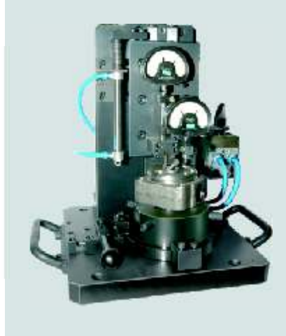
Multi - Gauging