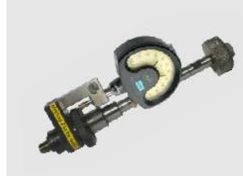
Thread runout Checking Gauge