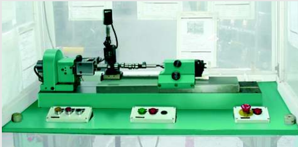
Profile Checking Equipment