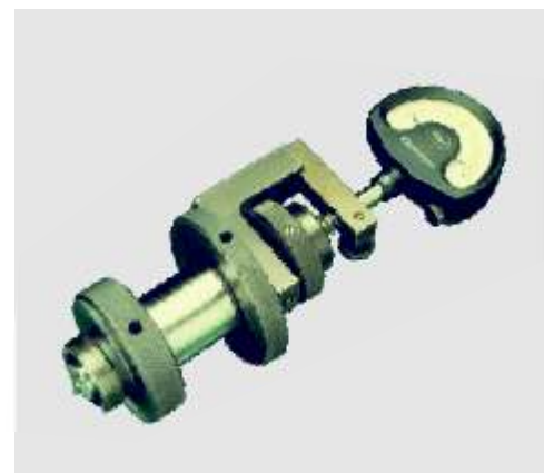
Thread locking Checking Gauge