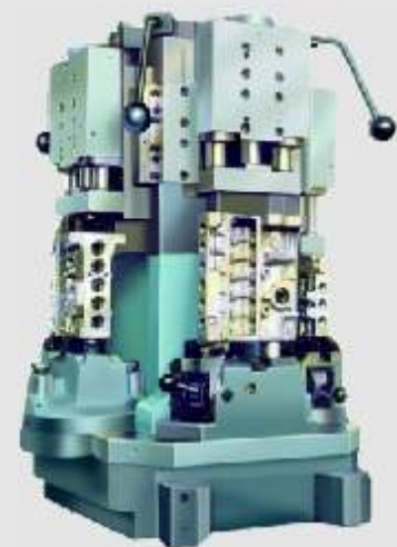
Hydraulic Clamping Fixture for HMC