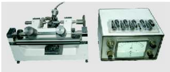
Fine Match grinding Gauge