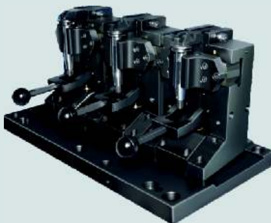
Fixture for VMC