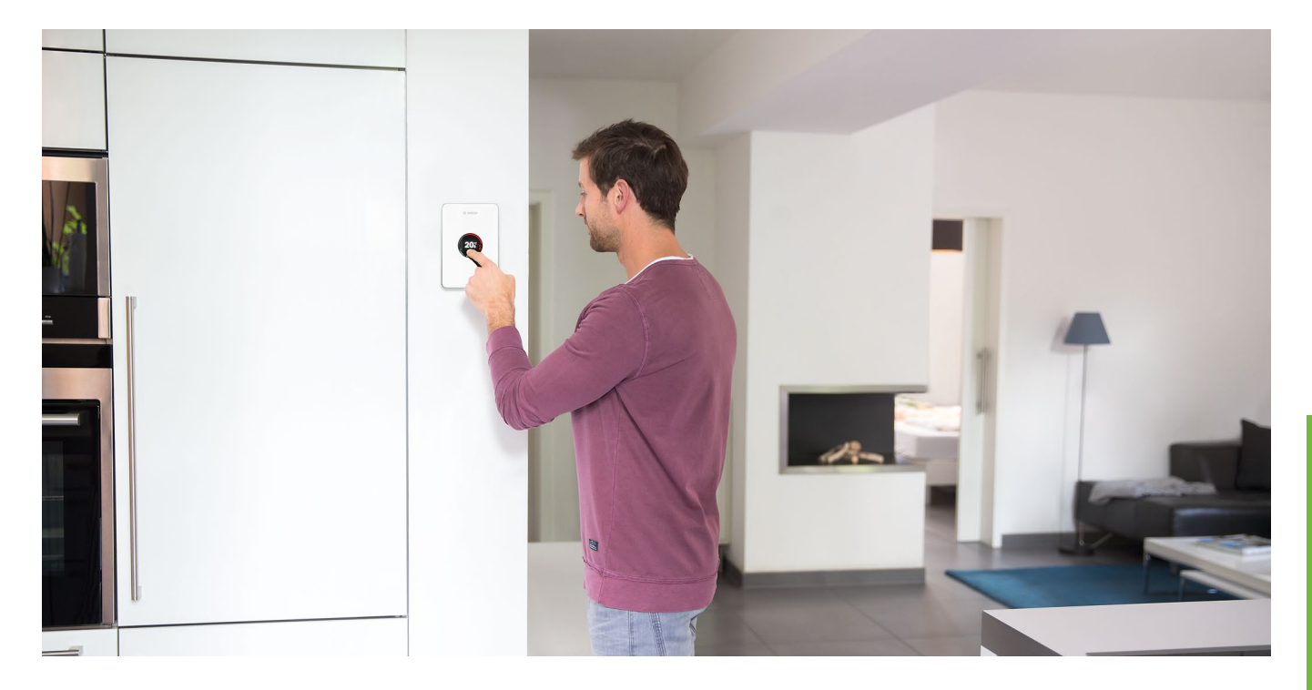
www.bosch-thermotechnology.com Solution provided by: Bosch Thermotechnology

Decentralized heat generation offers high energy-efficiency, operational reliability and low management costs. Decentralized solutions simplify billing according to consumption. As every heat generator has its own meter, the utilities provider can invoice energy costs directly to individual tenants. Every resident in the property can set the heating to their own preferences. Shorter supply lines mean lower heat losses.